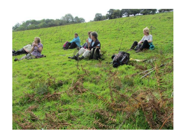
A leisurely lunch looking into the valley