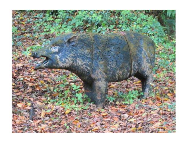
A boar sculpture at Clicket