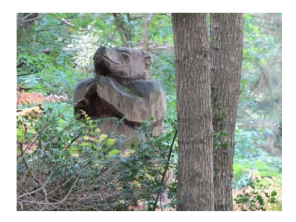
The bear near Vinegar Hill Viewpoint

Animal sculptures have been placed in the woods to add to the atmosphere. Our enjoyable walk continued and we made our way to Timberscombe and through the fields and woods to meet up again at the Long Combe track we had used earlier. On up towards Withycombe Gate and over Bat's Castle and a walk back into Dunster. 12.5 miles