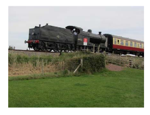
West Somerset Railway