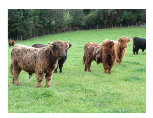
These young Highland Cattle looked so cute