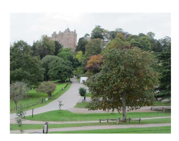
A view of Dunster Castle