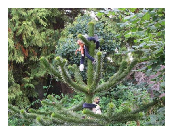
The monkey puzzle tree at Carhampton

Three of us headed out once again through the deer park and over Gallox Bridge to follow the Bat's Castle walk in an attempt to find the ponies for Mel. We walked across from Bat's Castle and down Park Lane heading towards Carhampton and the A39. At Carhampton we passed the monkey puzzle tree with toy monkeys climbing on it and took time to look in the reclamation yard. We walked along the A39 to the recreational park where we walked around the cricket pitch to pick up the path through the fields and then over the footbridge at the railway line and on to Blue Anchor. We had refreshment at the Driftwood Café at Blue Anchor then back along the new path to Dunster Beach and Dunster 7.5 miles