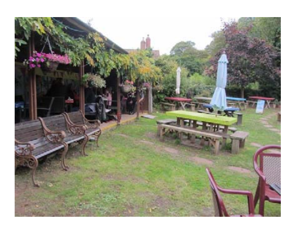
Horner Tea Rooms

This was a really good weekend with several good and challenging walks. Let us hope the weather is kind to us again when we meet in November. I am hoping for some lovely autumn colours.