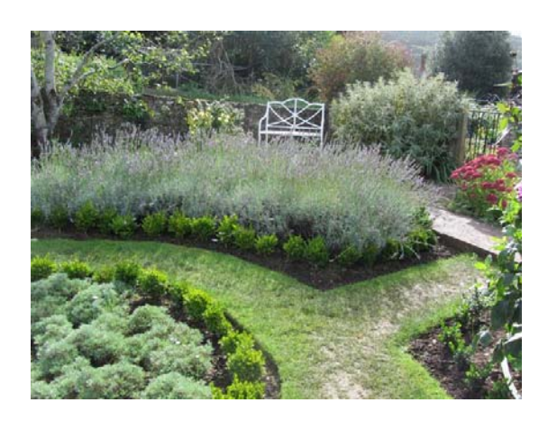
The walled garden