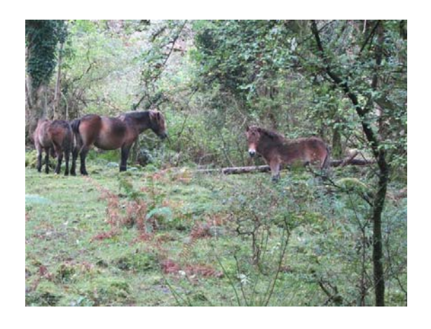
Ponies in the woods near Horner