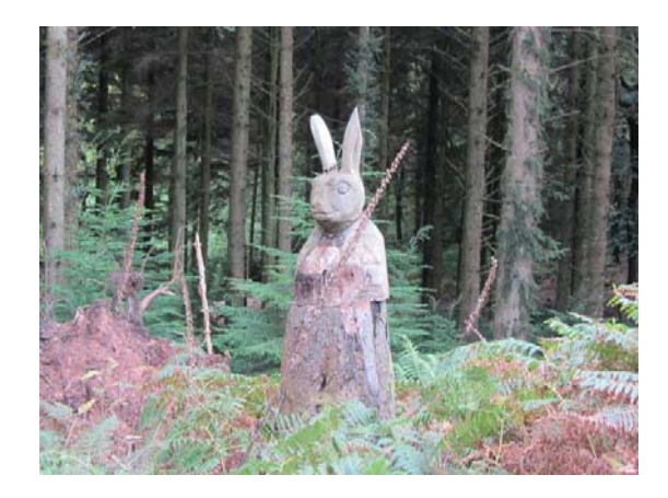
A carved hare at the top of Long Combe