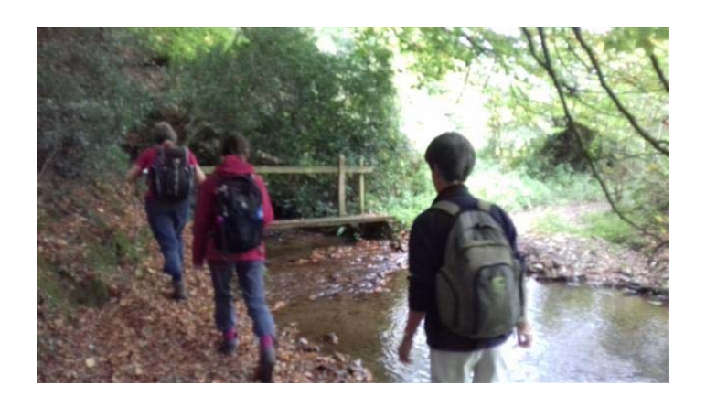
Making our way towards Croydon Hill