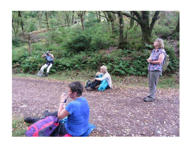
A well deserved coffee break after our long climb