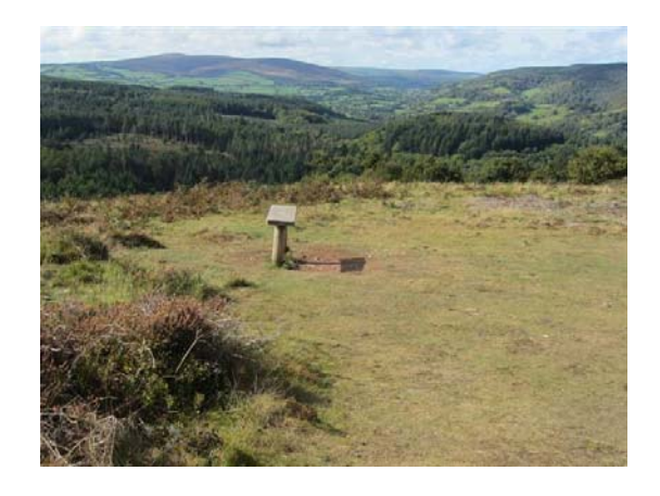
The view from Bat's Castle towards Dunkery Beacon

Jo and I walked through the Deer Park, over Gallox Bridge and on towards Bat's Castle. We took the alternative Boniton Path to Bat's Castle then back to Dunster 5 miles.