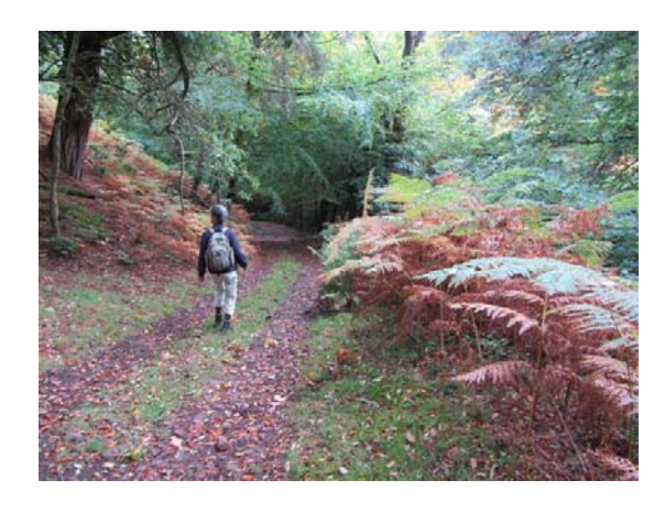
Walking though the woods from Webber's Post