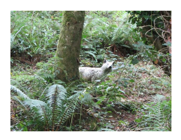
..... and a wolf