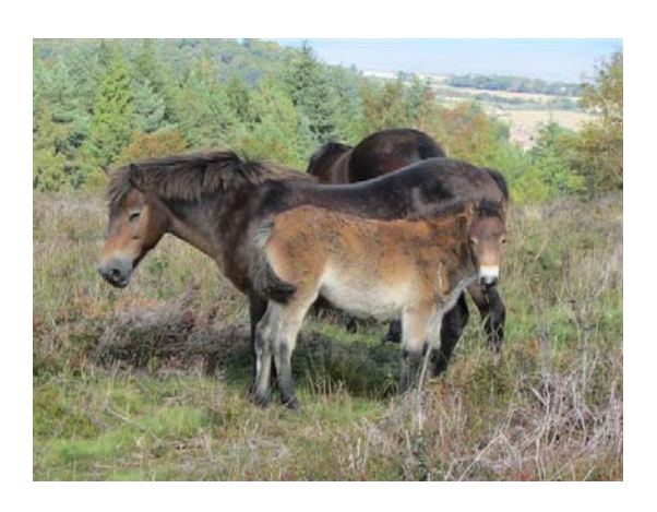
We met ponies and foals near Bat's Castle