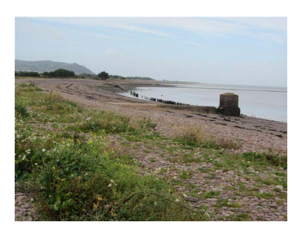
A view towards Minehead

When the other members arrived we took them on a local walk around Dunster before a cuppa