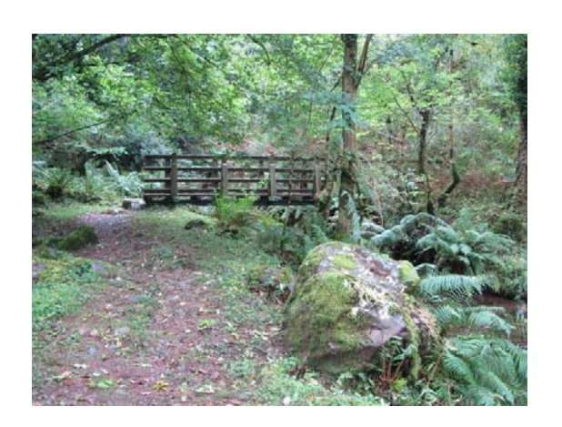
We crossed several bridges over the river