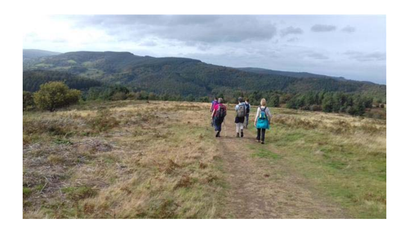
Walking back to Dunster with Grabbist Hill in view